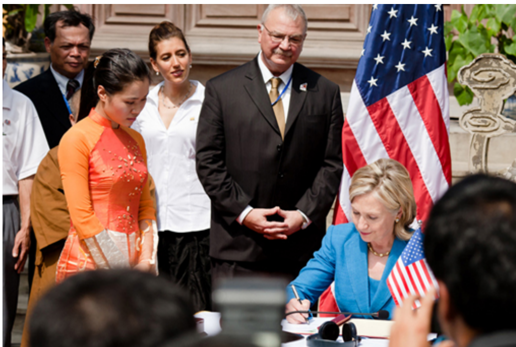
U.S. Secretary of State Hillary Rodham Clinton signs the U.S. - Vietnam Partnership Framework at HealthRight's Smile of the Sun Center in Hanoi.

Just this afternoon, here in Hanoi, Vietnam, I was part of an exciting meeting with U.S. Secretary of State Hillary Rodham Clinton, at HealthRight's Smile of the Sun Center. Secretary Clinton came to our Center for the signing of a five year agreement with the Vietnamese government to fight HIV/AIDS. Commenting on HealthRight's US government-supported program in Vietnam, Secretary Clinton said, "What we see here is the kind of comprehensive response that this disease demands."